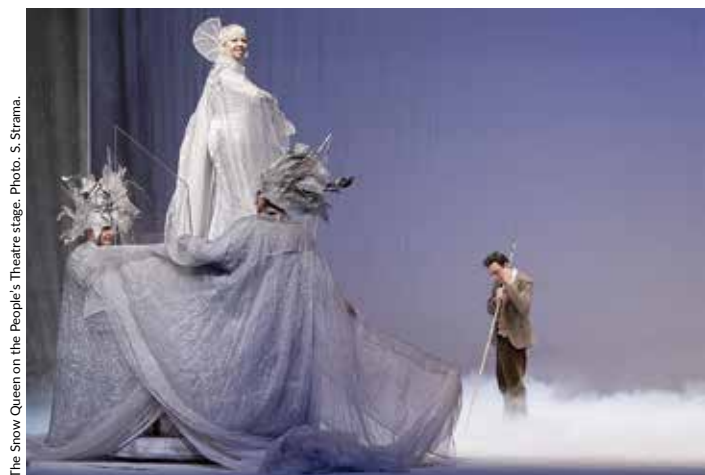
The Snow Queen on the People's Theatre stage.